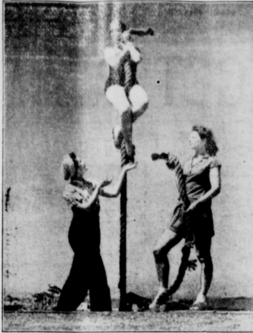
The Hindu rope trick has never been performed in the open in America to the knowledge of any living person. But here it is, folks, done by three chorus girls at the Golden Gate International Exposition on Treasure Island, in broad daylight, too.