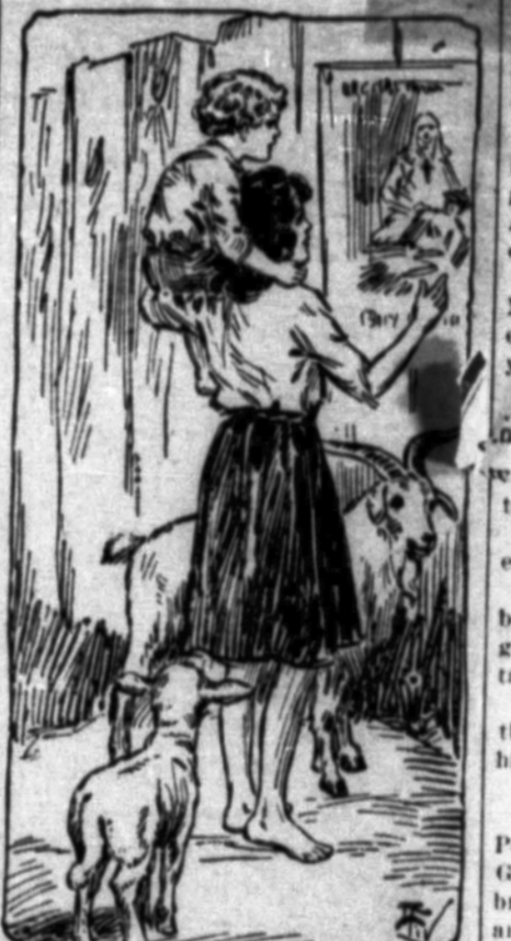
Then she went closer to the fence and spelled out the words under the picture: "The Greatest Mother in the World."