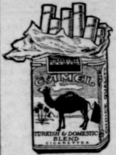
R. J. REYNOLDS Tobacco Co. Winston-Salem, N. C.