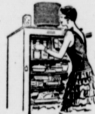
First G-E refrigerator helped create 100,000 jobs

Anyone who spreads fears that we may be facing another major depression ignores completely how much America has changed since the 1930's.