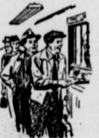
... will continue to keep America's economy expanding

These are only a few of the things General Electric is interested in, and other companies, of course, are hard at work on equally promising projects.