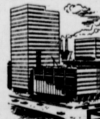
Today's new products and new industries...

The first electric refrigerator with a sealed-in mechanism was introduced by General Electric in 1926, and its production in that year required only a few hundred people. Today, refrigerators and freezers make up a billion-dollar business which employs more than 100,000 men and women in manufacturing, plus additional thousands in retailing and distribution. The freezer itself has made possible another whole new industry, frozen foods.