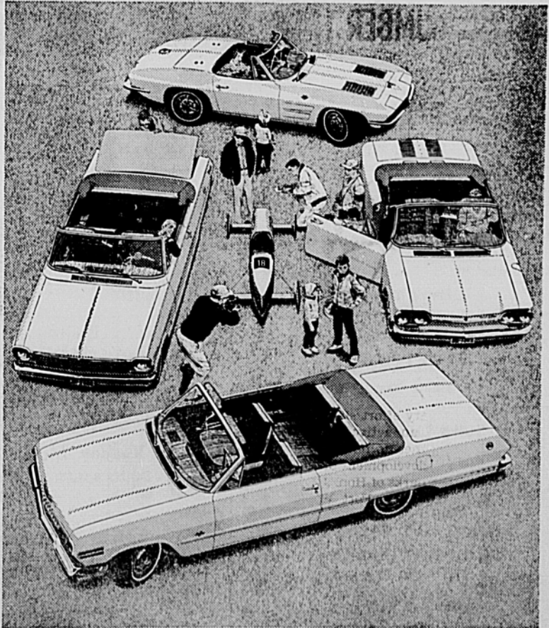
Models shown clockwise: Corvair Monza Spyder, Chevrolet Impala Super Sport Convertible, Chevy II Nova 100 Super Sport Convertible. Center: Soap Box Derby Racer, built by All-American boys.

NOW SEE WHAT'S NEW AT YOUR CHEVROLET DEALER'S