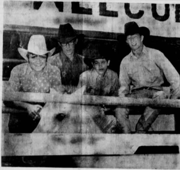
Pictured above are four members of the Baird FFA Chapter, welcoming you to the 9th Annual Rodeo now underway

All members are urged to attend this meeting.