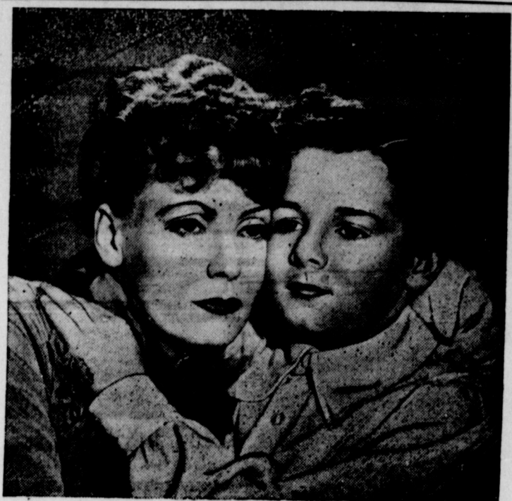
Greta Garbo and Freddie Bartholomew in "Anna Karenina"

As the goddess of modern mythology, Greta Garbo holds the world's championship. More myths have been woven around her name than any motion picture star. She has been the center of hundreds of rumors. She has been reported in love with half a dozen men at a time, yet she may not have known one of them. She is God's gift to the false rumor circulator, the inspiration to Dame Gossip, the delight of the headline writer.