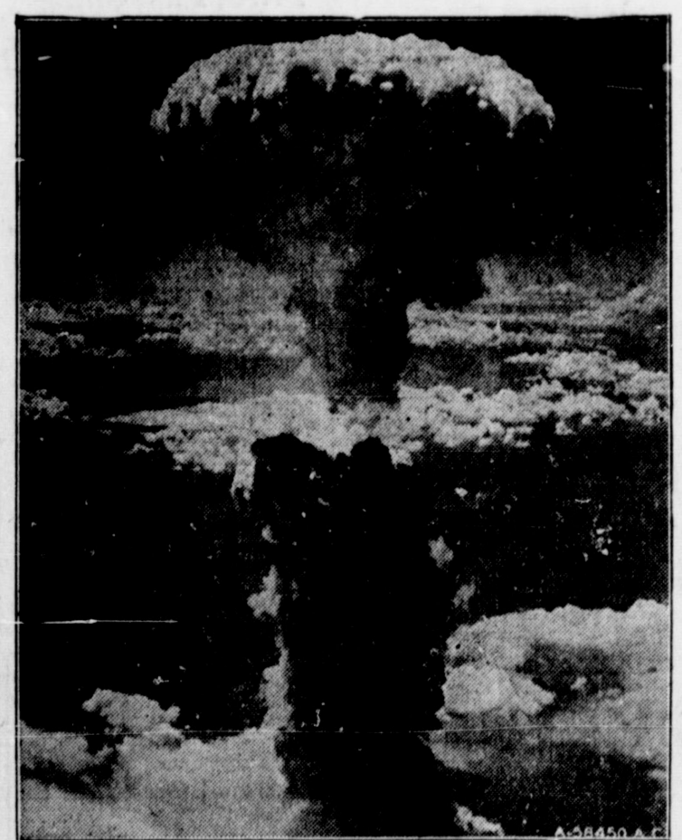
THIS BROUGHT JAP SURRENDER—The biggest news story of the century broke when the Army Air Forces dropped the first atom bomb on Japan, thus bringing to a close the war in the Pacific. Recent joint Army-Navy tests at Bikini atoll have seen the AAF again demonstrating the terrific power of this new bomb which, according to AAF officials, can be carried by a newly developed aircraft such as the XB-36.