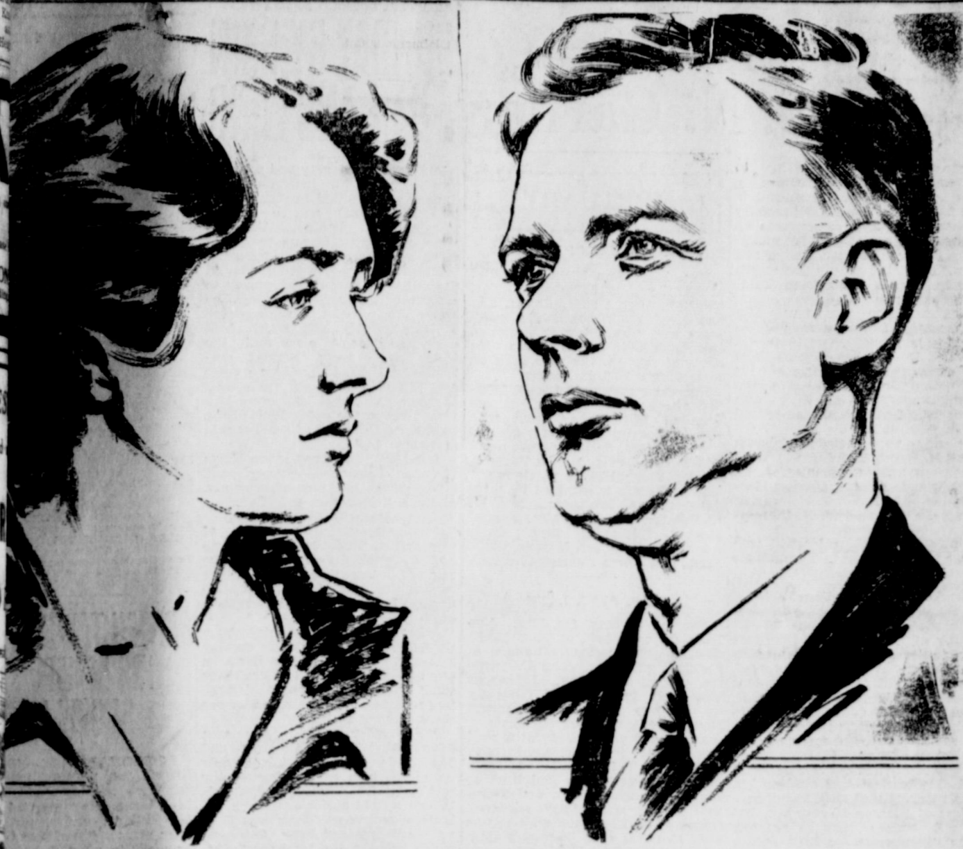
COLONEL AND MRS. LINDBERGH