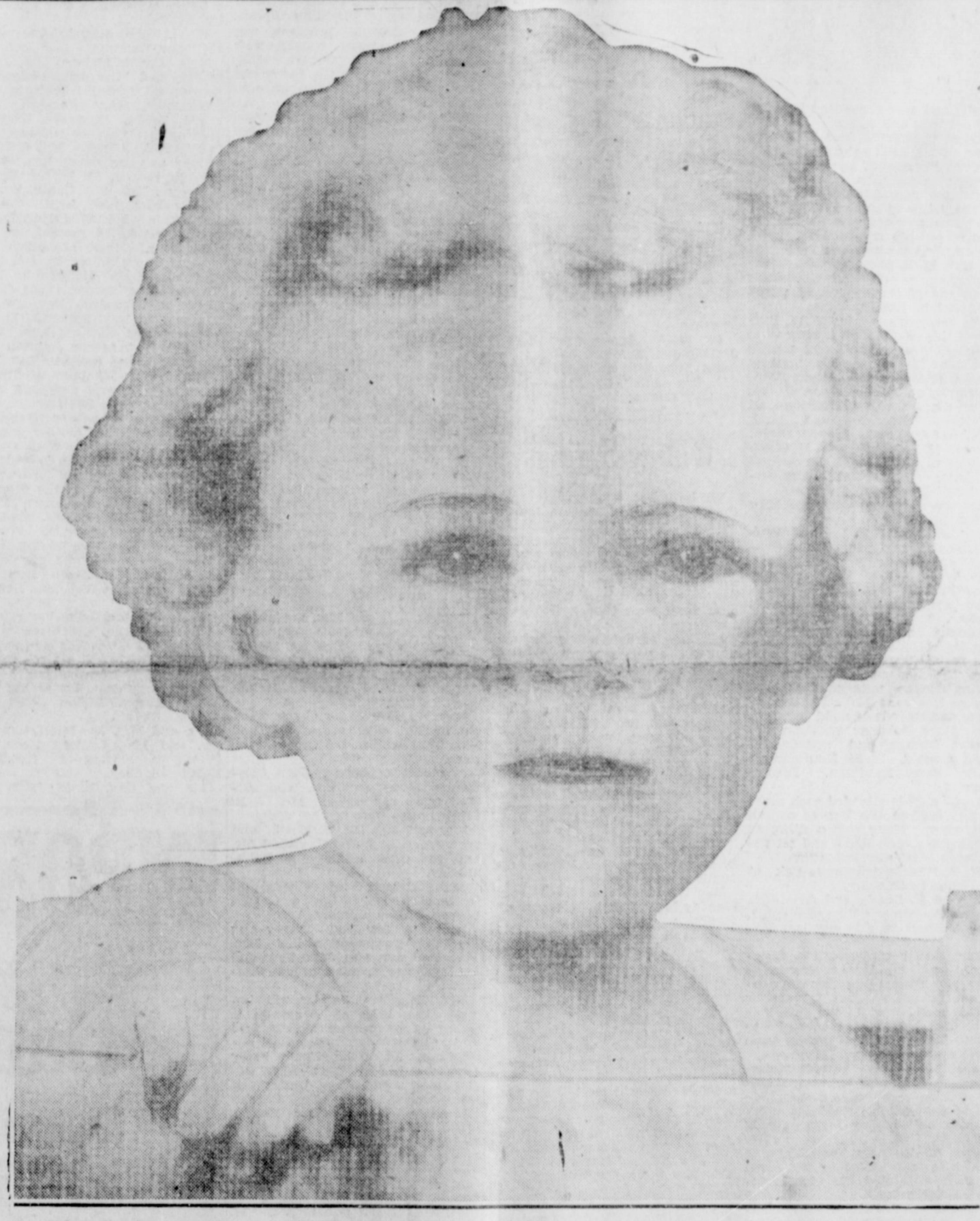
CHARLES A. LINDBERGH, JR.