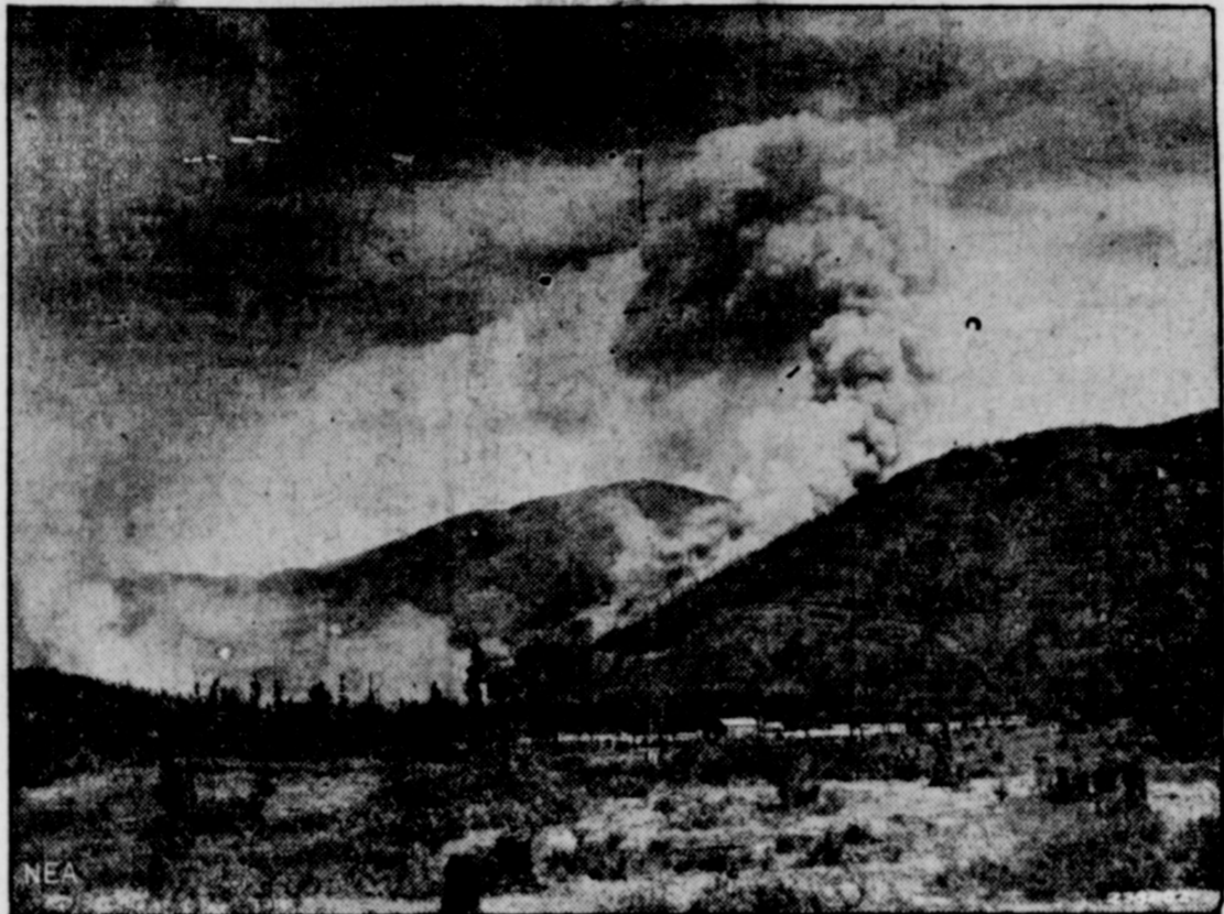
Beginning forth a great mouthful of smoke from an active volcano, the uncontrolled forest fire sweeping through forests in Montana, Washington and Idaho is shown in this remarkable picture...