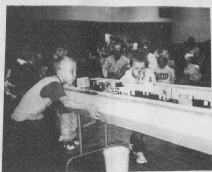
OFF AND SAILING - The Gruver EZRA Boy's Club was off and sailing this past September 20th in their Catamaran Competition in Gruver. To see how the races went, please see the related story.

and onion, pinto beans, Spanish rice, lettuce, tomato, flour tortilla, pineapple, and milk. Friday, October 6 Cheeseburger, French fries, salad, pork and beans, cookie, and milk. BREAKFAST Monday-Muffins, fruit, and milk. Tuesday-Ham and egg burrito, fruit, and milk. Wednesday-Cinnamon toast, fruit, and milk. Thursday-Cereal, toast, juice, and milk. Friday-Cinnamon roll, fruit, and milk. PRINGLE-MORSE CISD LUNCH MENU Monday, October 2 Tacos/Soft Burrito, beans, salad, cookie, and milk. Tuesday, October 3 Steak fingers, potatoes, gravy, salad, rolls, fruit, and milk. Wednesday, October 4 Hamburgers, fries, fruit, and milk. Thursday, October 5 Meat loaf, macaroni and cheese, green peas, salad, rolls, dessert, and milk. Friday, October 6 Sandwich, stew, fruit, ice cream, and milk. BREAKFAST Monday-Cheese toast, toast, juice, and milk. Tuesday-Cereal, toast, juice, and milk. Wednesday-Pancake, sausage, juice, and milk. Thursday-Muffins, toast, juice, and milk. Friday-Sausage, biscuit, juice, and milk.