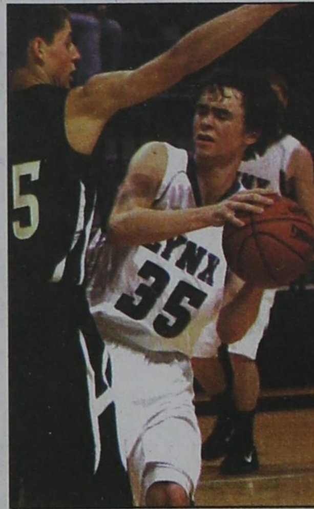
Tate Batton Spearman Lynx