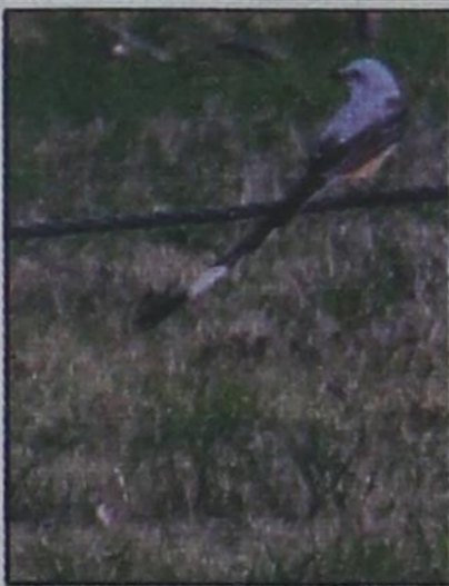
This is a scissor-tail flycatcher, in the park behind the dam at Lake Palo Duro

ported a good bit of activity. Fishermen were out but still not catching much. Some mountain bikers came, and there were lots of "lookers".