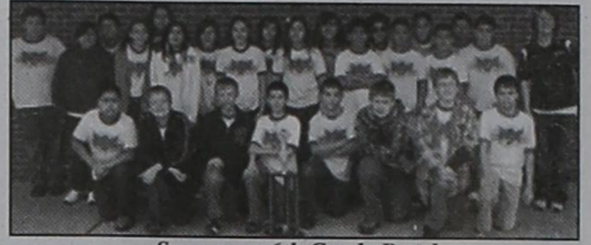
Spearman 6th Grade Band

Congratulations is extended to these fine musicians!