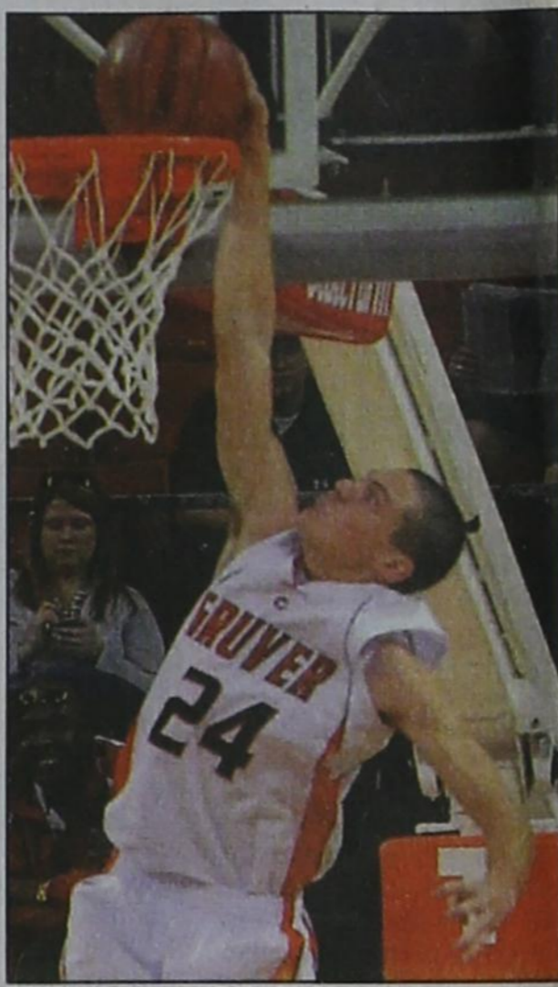
Rily Urban Gruver Greyhound