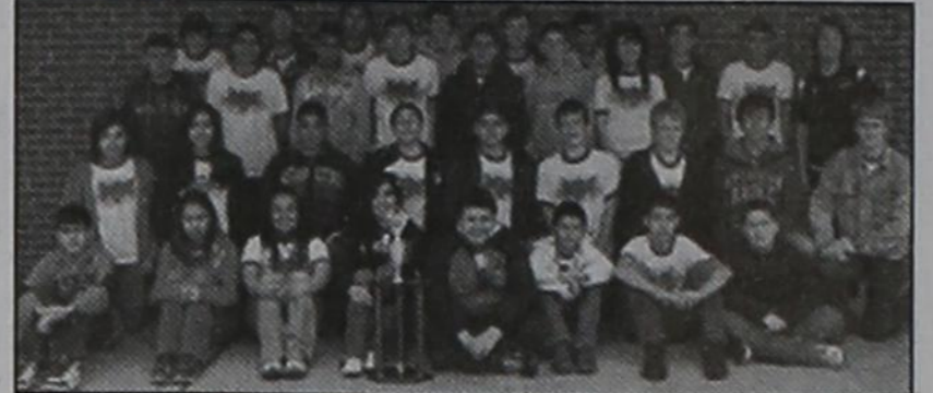
Spearman 7th & 8th Grade Combined Band