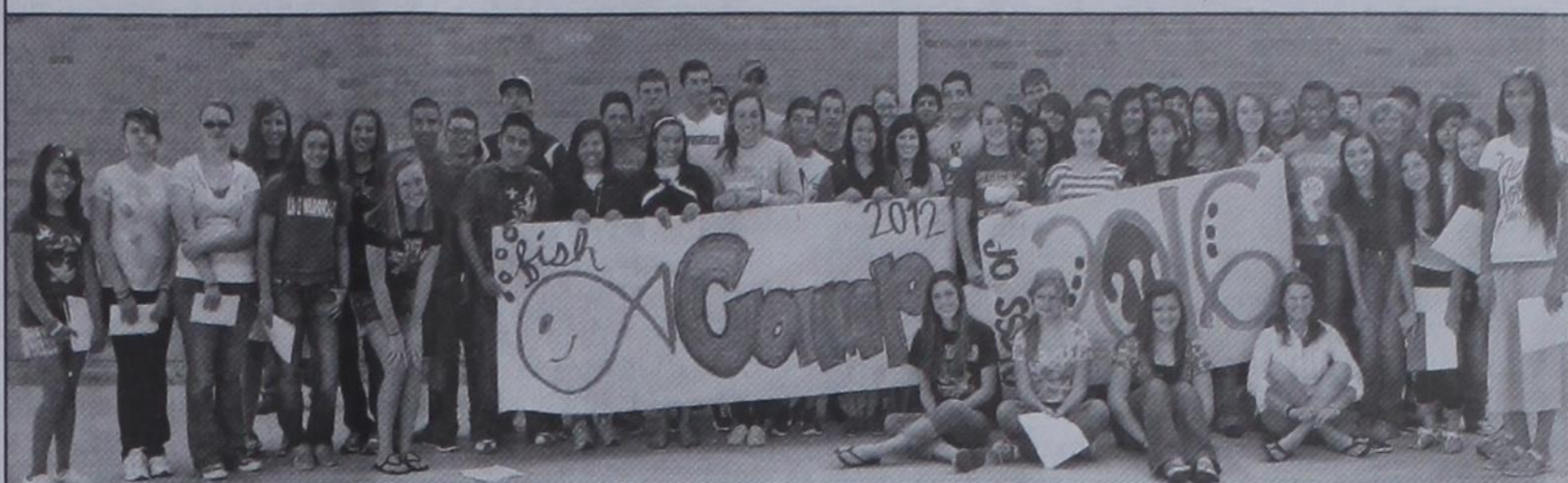
The Lynx are TOUGH – The Lynx are LEAN – Saves the Class of 2016!!

The freshman class at Spearman High School recently participated in the 2012 Fish Camp. During camp, students reviewed rules and procedures, rotated through different sections of the high school, and rotated briefly through all 8 of their 2012-2013 9th grade classes. The students are all geared up for a great school year!