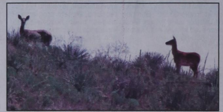
The picture this week shows two whitetail does. The one on the left is dark gray and the one on the right is the normal reddish color.

The pool of water at the bridge is now almost separated from the lake. As the