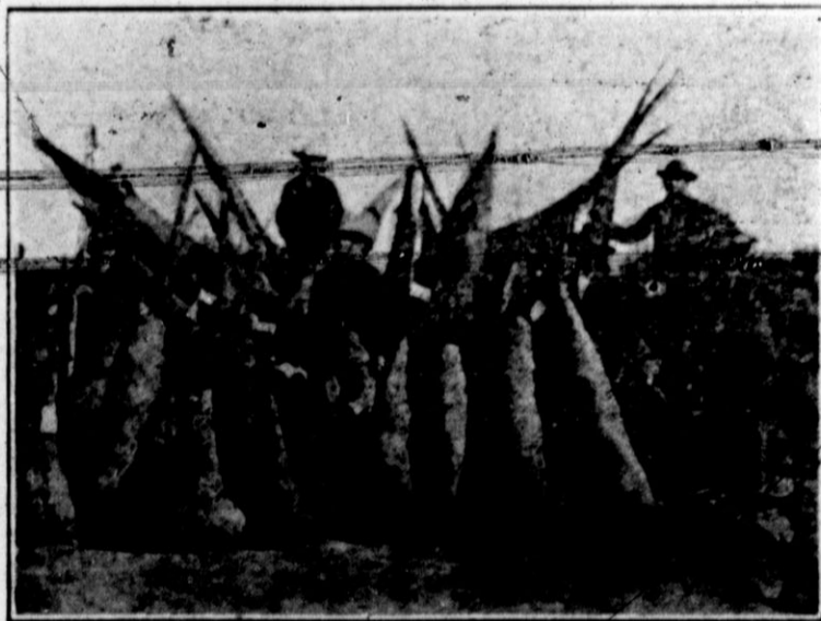
READY FOR SHIPMENT

The patronage of the general public is cordially solicited