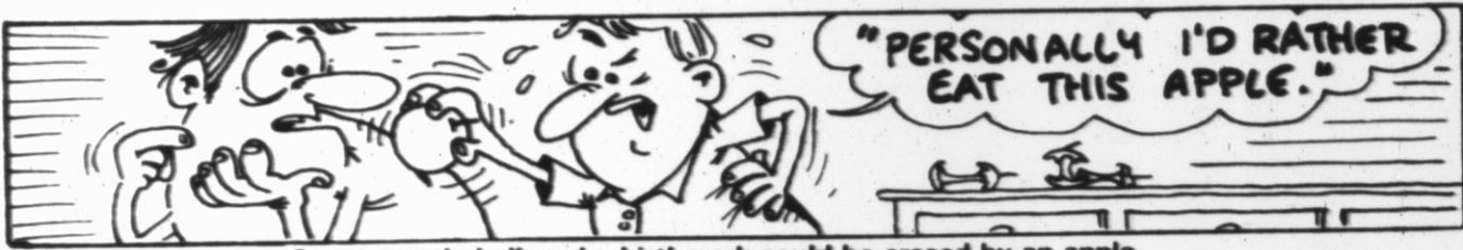
Some people believed a birthmark could be erased by an apple.