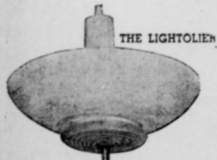
This efficient fixture combines graceful lines with scientific light diffusion. Regular price $2.45. NOW SPECIAL AT $1.75

It's a simple, inexpensive matter to give your home a miraculous beauty treatment by modernizing your lighting with the new screw-in adapters. You don't have to buy to see how they look in your home, either! Just call us today and we will install them for a free trial right in your own home. Six styles to choose from—all at specially reduced prices.