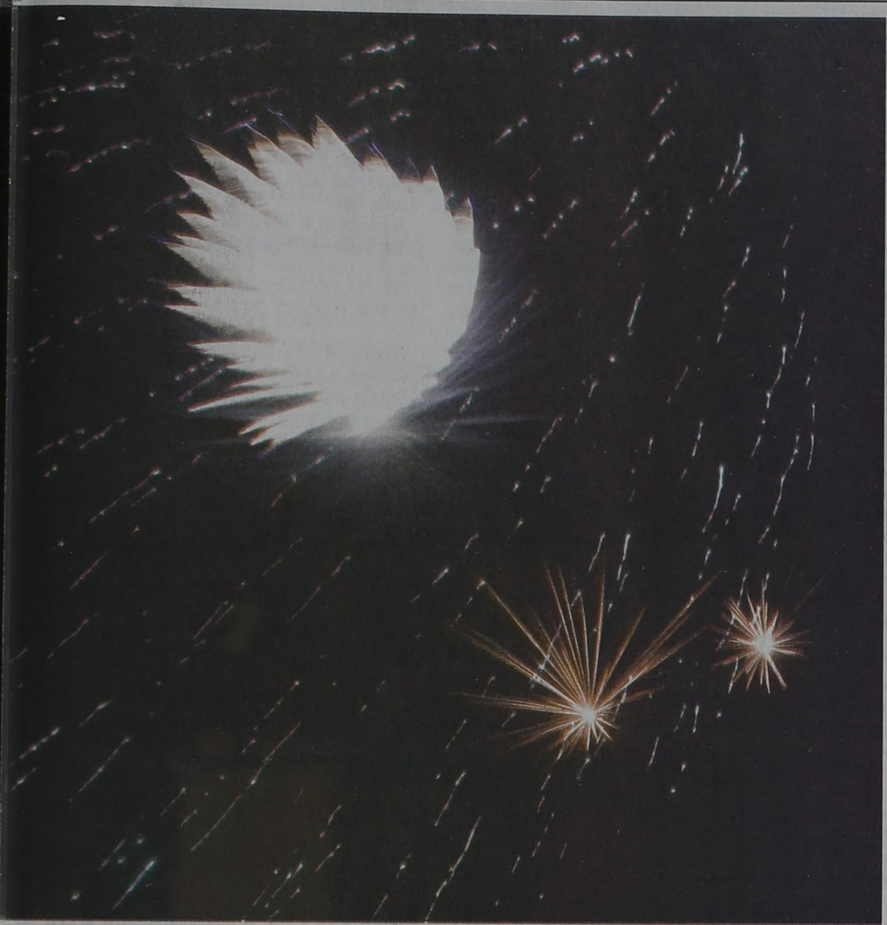
This spectacular scene was captured Sat. July 4, 2015 during the Rockwall Independence Day fireworks show at Harry Meyers Park. There was a striking similarity between the two lights at the bottom, and the alignment of the planets Venus and Jupiter high in the western sky during the fireworks show.

Volume Number 29 • Issue Number 28 • USPS 002-495 • Thursday, July 9, 2015 • Single Copy Price 75 Cents • Copyright 2015 Rockwall County News