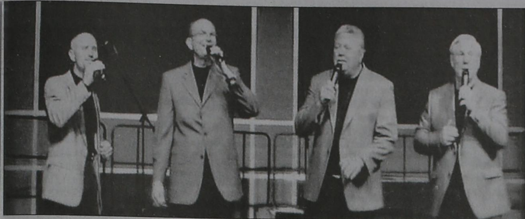
The Pathfinders Gospel Quartet from Midlothian, pictured above, will perform at 4 p.m. on Sunday, Aug. 9, at the First United Methodist Church, 1200 E. Yellow Jacket Lane, Rockwall. The group, which has been together for 14 years, will sing traditional gospel music at the annual Old-fashioned Chautauqua program sponsored by the Sailsetters 55 and Better group. The public is invited to the performance. Complimentary childcare will be provided with advance registration (9720771-5500). The Rockwall Squares dance group also will perform and a free-will offering will be taken. A cookies-and-punch reception will follow.

Without the words "you shall," a chronology exists in which baptism (being filled with holy spirit) is a pre-requisite to receiving the gift. A comparison with Acts 2:4 reveals the same chronology. Being filled with holy spirit was pre-requisite to speaking in tongues.