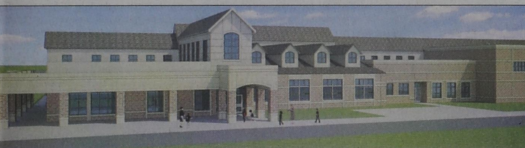
Shown above is the graphic rendition of Rockwall ISD's Elementary School 14. The district is currently making nominations from the public for the naming of the new elementary.