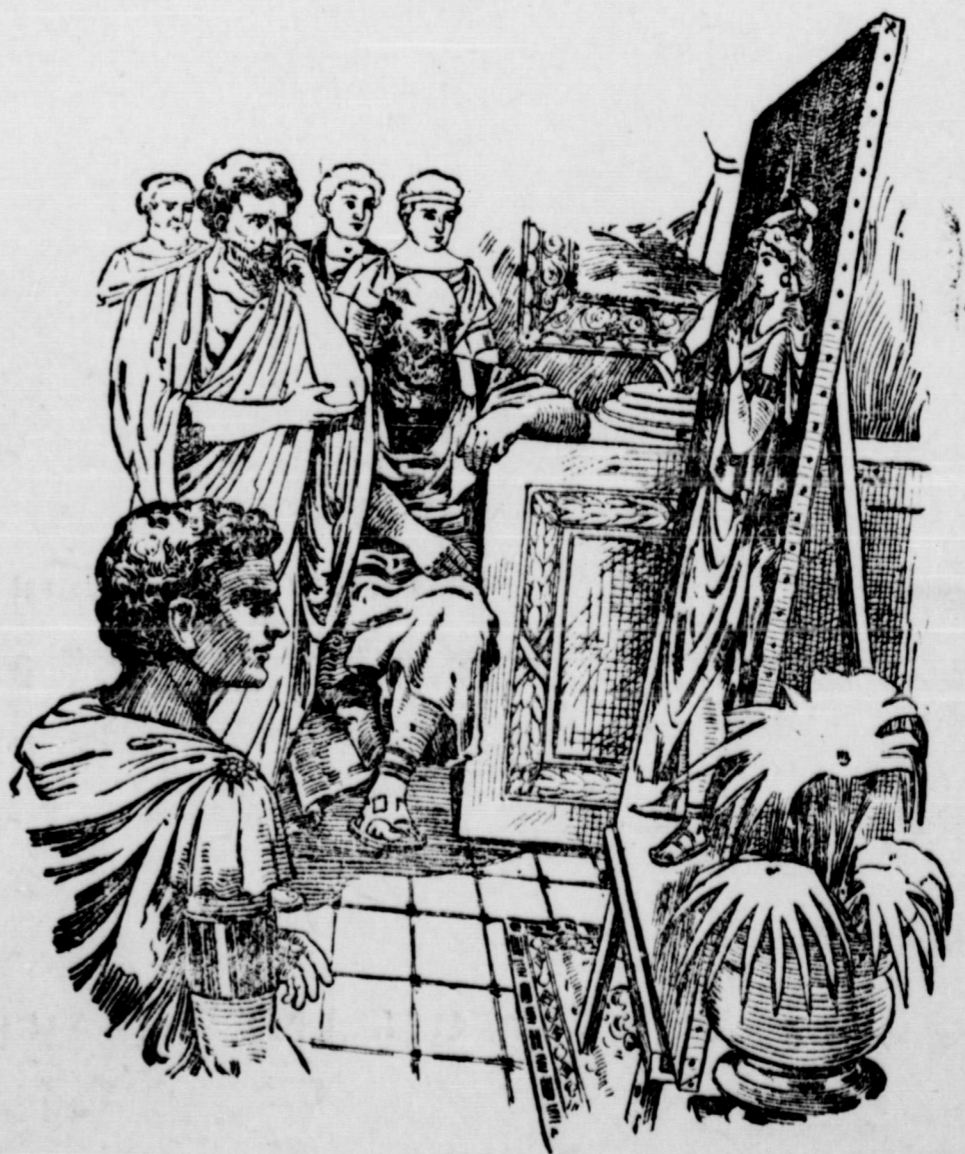
APPELES EXHIBITING A PAINTING.

WHEN Appeles was exhibiting a beautiful painting a cobbler directed his attention to a fault in the shoe and the master immediately corrected it; the shoemaker then criticised the shaping of the leg and Appeles said, "Shoemaker, stick to your last." The advice of the painter stands as good in government as it does in art, but unfortunately many of our legislators have no last and others insist on legislating the most on things they know the least about. If our legislators would "stick to their last," we would soon have "fewer laws and better laws."