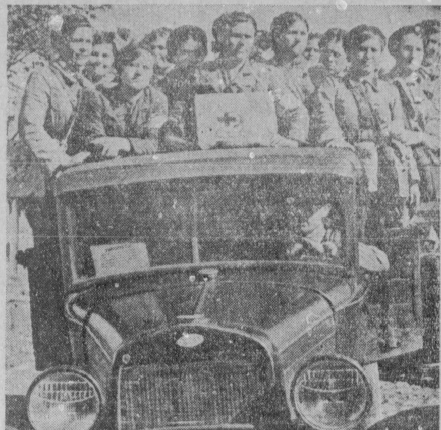
Russian Red Cross nurses ride a truck to their posts during an anti-air raid drill in Moscow, U.S.S.R. Recently these nurses have been working under fire, as the Nazi Luftwaffe attempted again and again to burn out this camouflaged capital of painted spires and teeming millions. Moscow's citizens took the raids stoically.