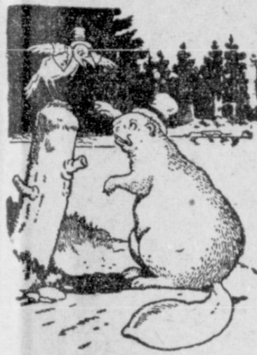
"Let's be friends," said he.

Now, of course this wasn't a nice thing for Paddy to do, for it only made Old Man Coyote all the angrier. You see, Paddy knew perfectly well that Old Man Coyote has no love for the water, while Paddy lives in it most of the time. So, knowing that he was perfectly safe, he just couldn't resist the temptation to say some unkind things. You know he had had to be on the watch for days lest he should be caught, and so he hadn't been able to work quite so well as he could have with nothing to fear, and he still had a