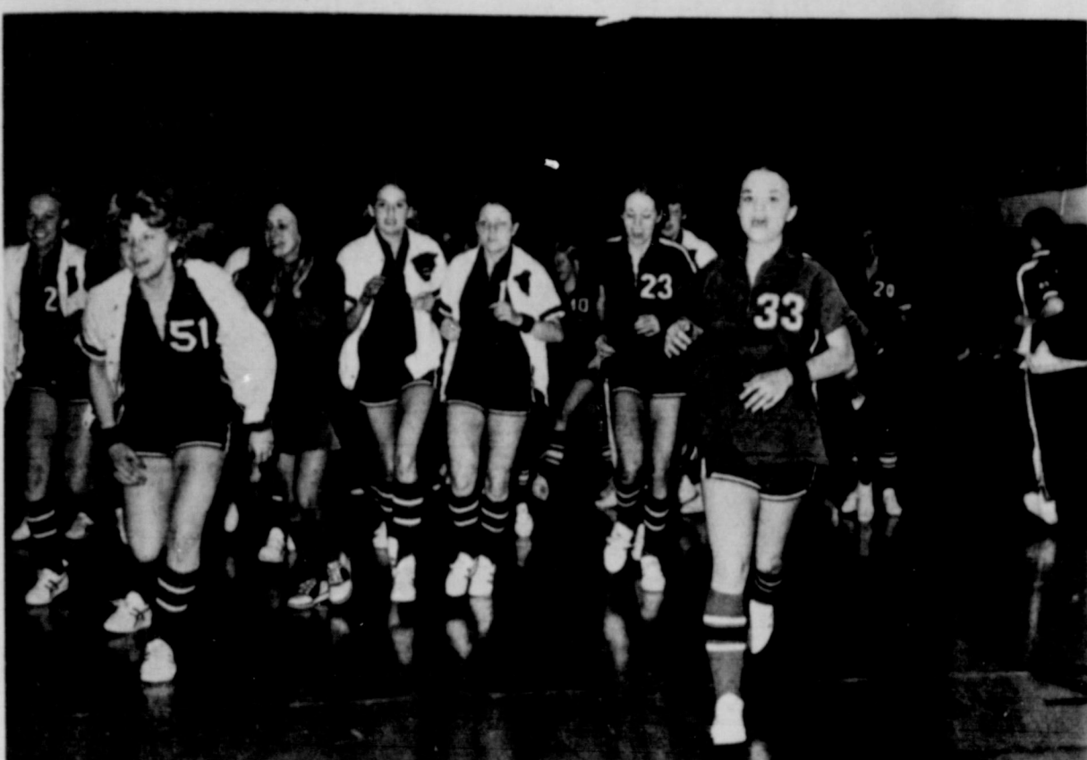
HAPPINESS IS WINNING STATE --- The girls come off the court after the final game.