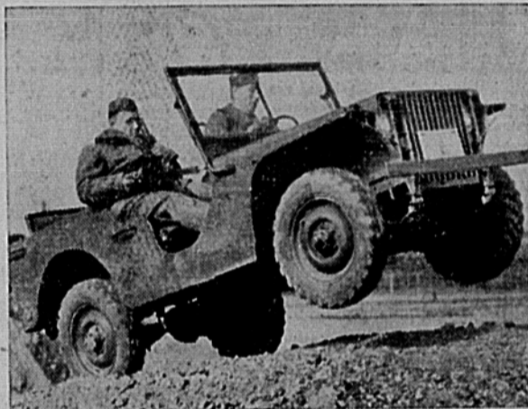
Speed shot at Camp Holabird, Maryland, during tests on new Light Reconnaissance and Command Cars for United States army. They carry machine gun and crew of three men at approximately 60 miles an hour. Can climb steeper hills than tanks. The Ford Motor Company, which built the ditch-jumper shown above, has an army order for 1500 of these units.