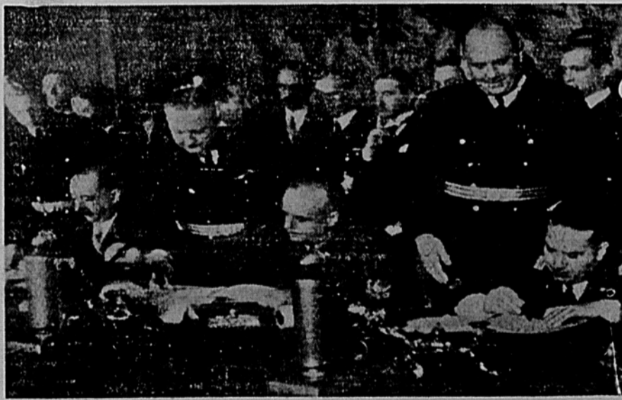
Bulgaria becomes a member of the Axis, signing on the dotted line in Belvedere Palace, Vienna. Putting their signature on the pact are Bulgarian Premier Bogdan Philoff (seated left), German Foreign Minister Joachim von Ribbentrop (center) and Italian Foreign Minister Count Galeazzo Ciano. Almost before the ink was dry, German troops occupied Bulgaria, moving ominously closer to Greece.