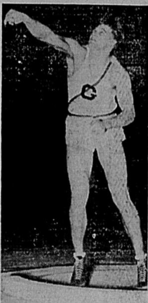
Al Blozis, of Georgetown, breaks the world shot-put record as he wins the event at the ICAA games in New York. The speedray catches him in the act of heaving the heavy shot 56 feet 6 inches, bettering his own indoor record of 55 feet 8 1/2 inches.