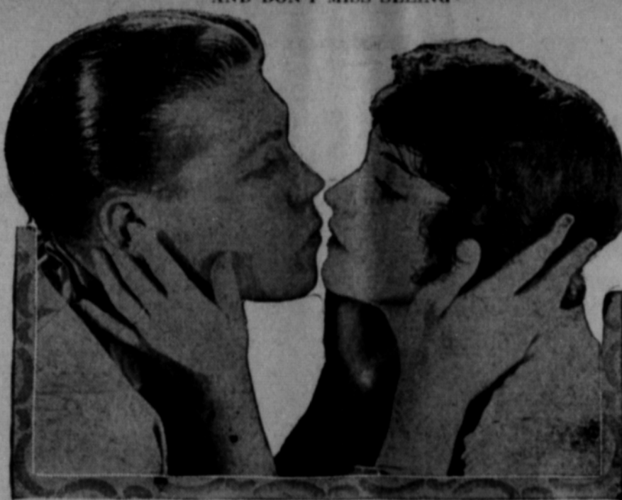
VIOLA DANA in "PLEASE GET MARRIED"

TO ANY COUPLE THAT WILL GET MARRIED ON OUR STAGE FRIDAY EVENING, MAY 21. DON'T DELAY, BUT BE THE FIRST TO APPLY. YOU WILL GET PREMIUMS TO THE AMOUNT OF $150.00. AND DON'T MISS SEEING.