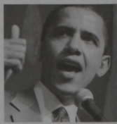
"Who is ultimately going to make the key decisions in that area of this economy that has so much direct, personal impact on the quality of your life?"