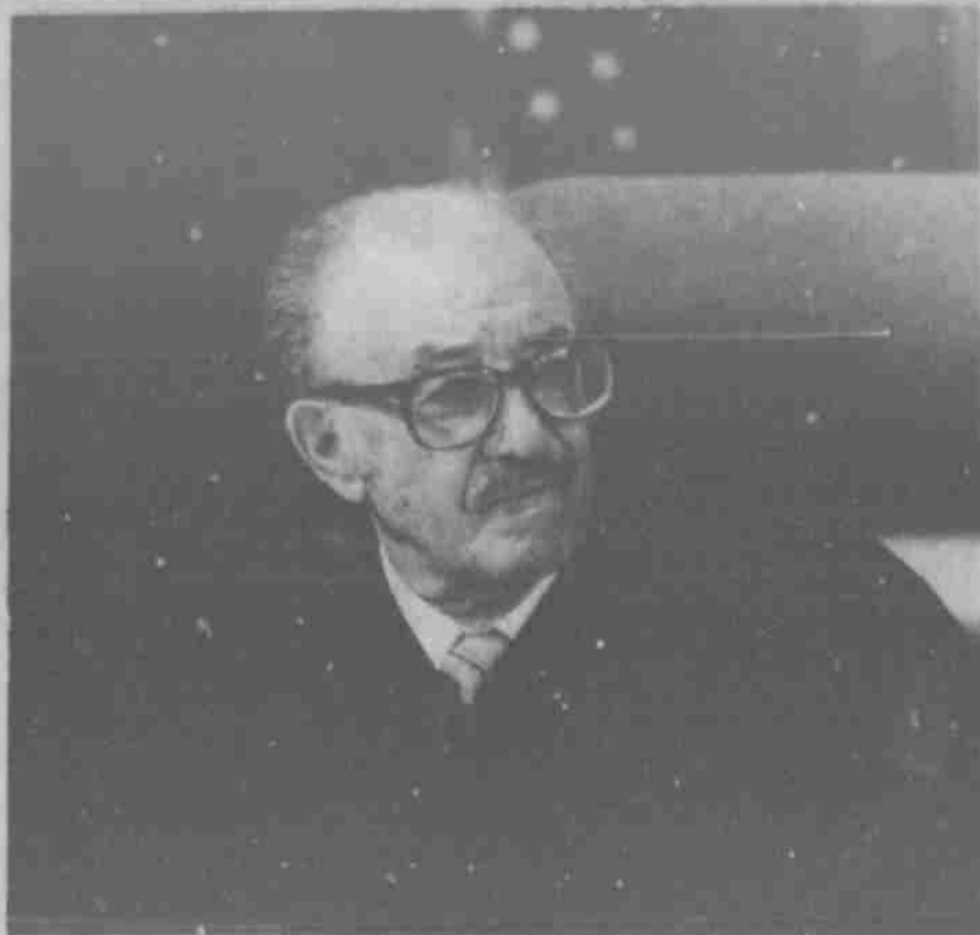
NOTED JURIST! Bernard S. Jefferson, former justice of the California Courts of Appeals, appeared in a special "Superior Court" show last month as a kick-off to a week long salute to the 200th anniversary of the United States Constitution. "Superior

Washington, DC - According to the Labor Department the unemployment rate among American Blacks held steady last month at 14.3%. Meanwhile,