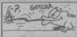
The chameleon's tongue is as long as its body.