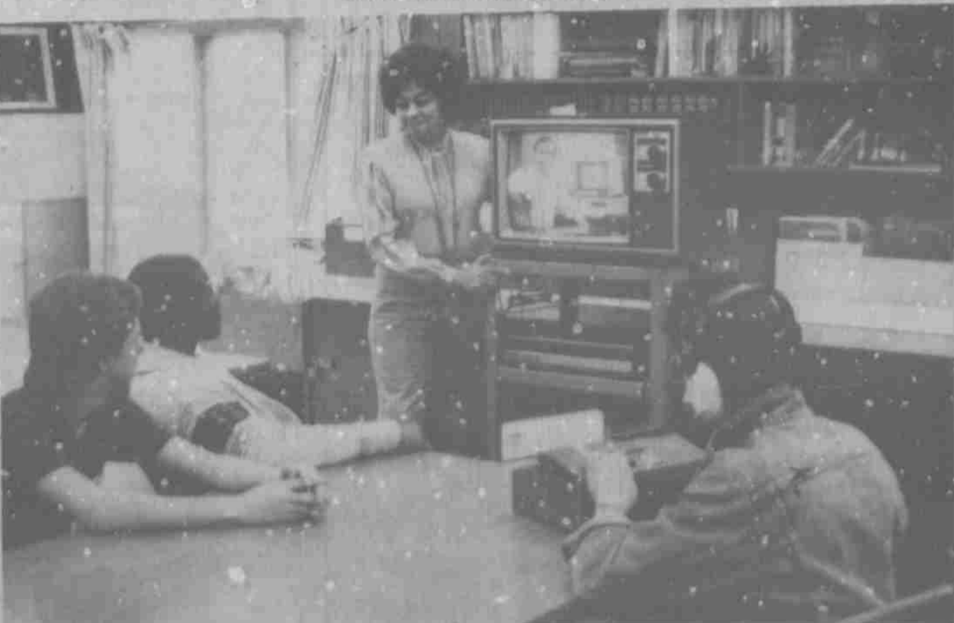
Corpsmembers prep for their GED classes and tests in

Young adults, 16 to 22 years of age, interested in the program, may obtain information from the Texas Employment Commission.