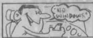
James H. Doolittle proved the ability of instrument-guided flying when he took off and landed entirely on instruments on September 24, 1929.