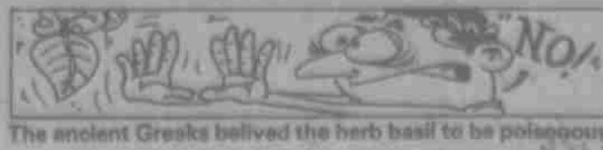
The ancient Greeks believed the herb basil to be poisonous.

HIRING! Government jobs your area. $15,000 - $68,000. Call (802) 838-8885. Ext. 4140.