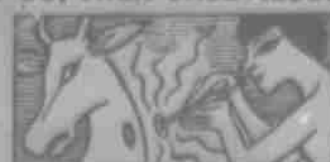
Cattle branding was practiced 3,000 years ago. Old tomb paintings show Egyptians branding their cattle.

some of our young Black boys ... PARENTS ... we will need your help ... WILL YOU HELP US?? IF SO, THEN CALL ALSON!