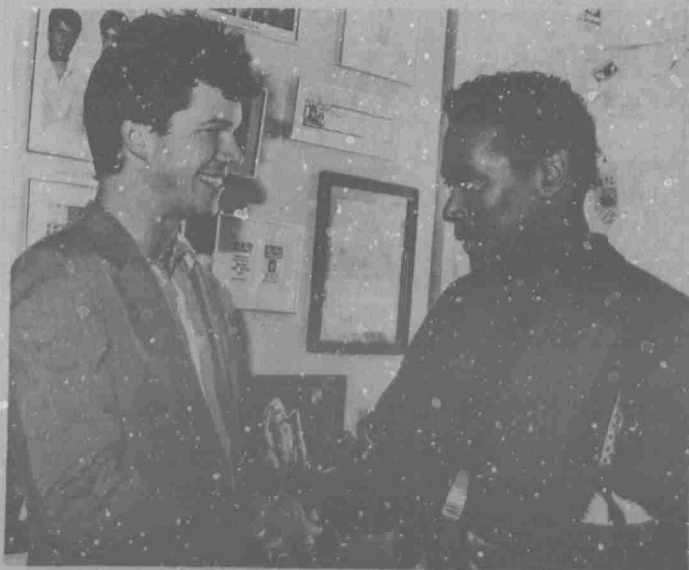
Luther Vandross is one of the many Black artists who are featured regularly on "Night Tracks," Superstation WTBS' Friday and Saturday night music video program. Airing 11 p. m. to 6 a. m. (EST) both nights, "Night Tracks" features 25% Black contemporary and R&B videos in its regular rotation. This progressive approach has resulted in a higher viewership for "Night Tracks" in its timeslot in comparison to MTV, according to Nielsen ratings.

A Voteless People; Is A Hopeless People!