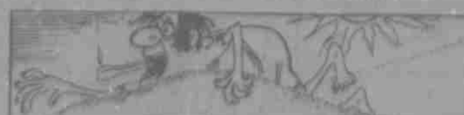
Our driest state is Nevada. Its annual rainfall averages 8.8 inches.