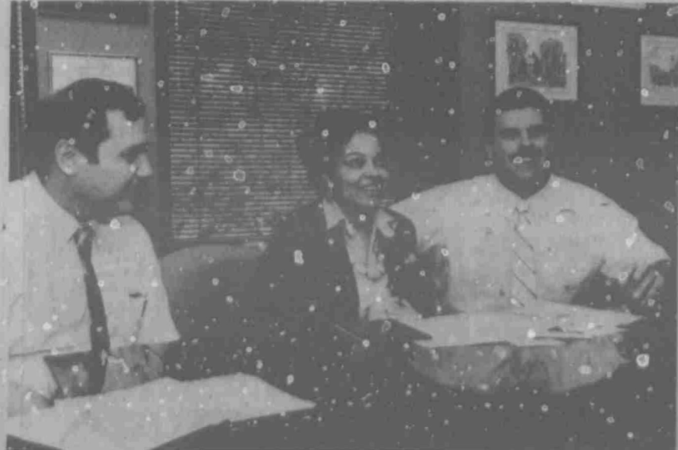
Representatives meet to discuss installation of video teleconferencing equipment at Prairie View A&M University. To the left and

Lubbock Alumnae Chapter, since its inception in 1952, has given annual scholarships, Thanksgiving baskets and gifts to various community agencies at Christmas time. The