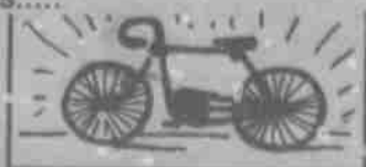
The word "bicycle" is a combination of Latin and Greek root: bis is Latin for twice and kylos is Greek for circle.