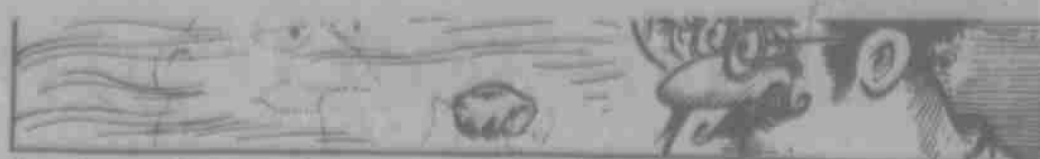
People once believed that carrying the green and red quartz known as the blood-stone or heliotrope would render them invisible.