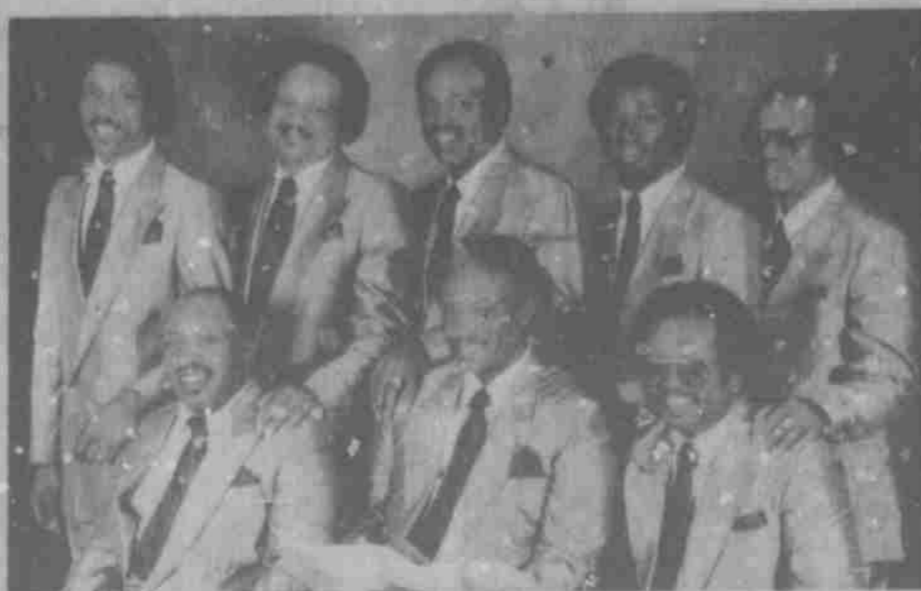
The Zion Jubilee Singers

The Zion Jubilee Singers of Bryant, Texas will be appearing at the St. John Baptist Church, 1712 East 29th Street, on Saturday, August 31st, at 7:30 p. m. and on Sunday afternoon, September 1, 1991, at 3:00 p. m.