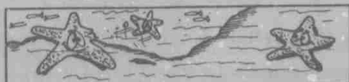
A cut up starfish will regrow into several starfish.