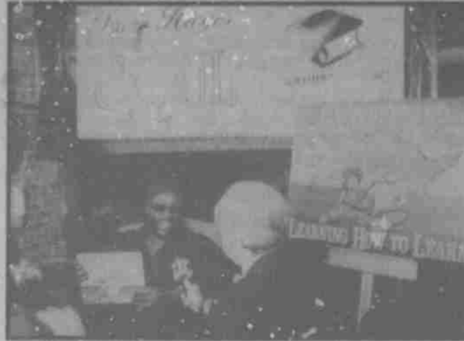
The Legendary Isaac Hayes, enstooled king in Ghana and international spokesperson for the World Literacy Crusade, discusses his recent trip to the African nation where he brought a delegation of trainers in study technology, breakthrough study methods developed by author and humanitarian L. Ron Hubbard.

Those who would like to find out if there is a World Literacy Crusade program in their area or who would like to help stan one, should contact the group at 3209 North Alameda Street, Suite B, Compton, CA 90222 (address) or call 310-537-2273.