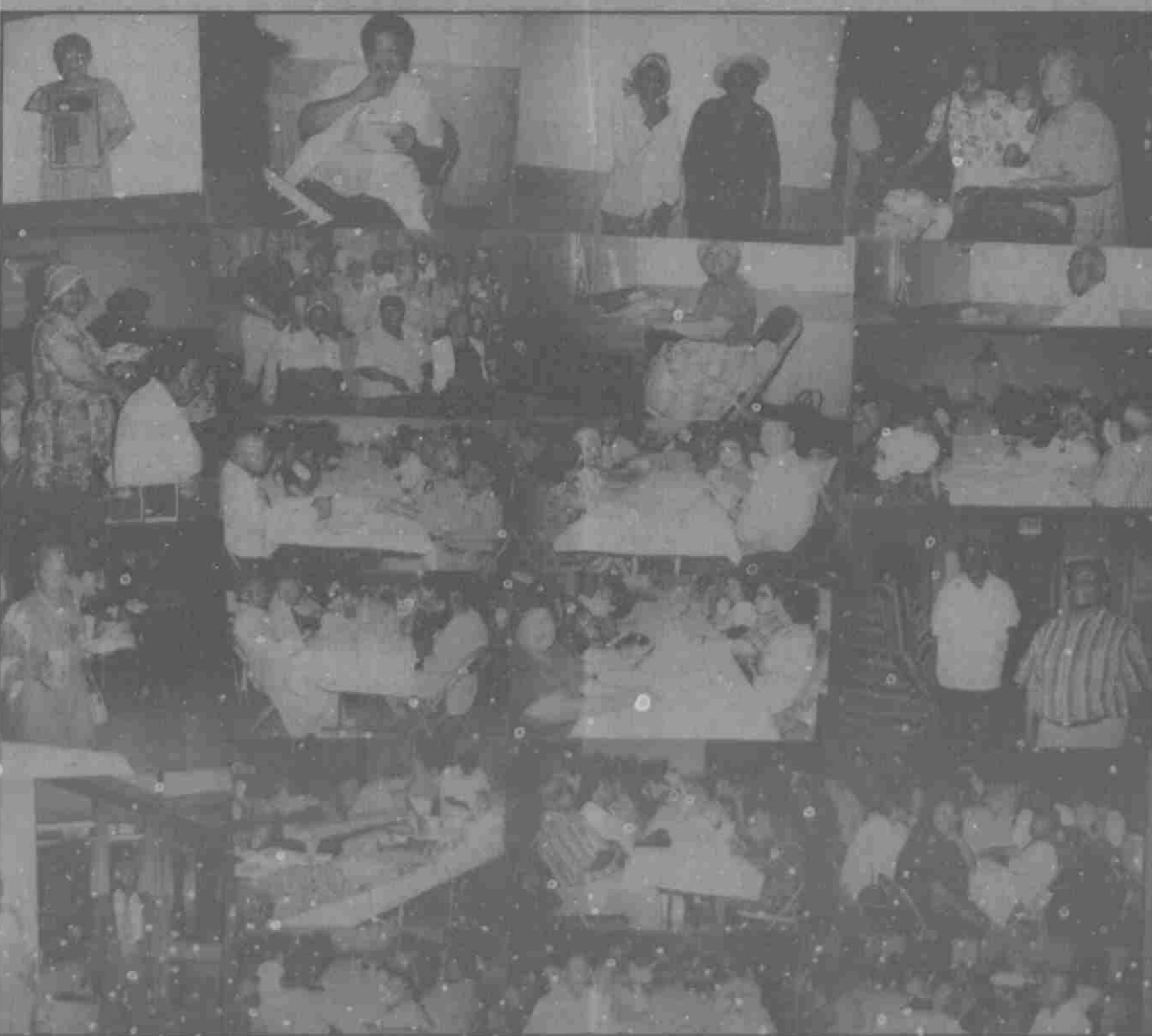
We couldn't have done it without you. Your contributions, hard work made it all come together.

Thursday, August 27, 1998 - Mae Simmons Community Center "One of the Largest Groups Ever!"