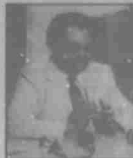
Lubbock, I would.

If I could wave a magic wand and make all parts of Lubbock I competitive self-sustaining marketplaces, I would, but I can't. Wish I could. If I could utilize land in the eastern one-third of the city, the under-utilized land, I would also develop the undeveloped areas of the eastern one-third of the city. I would also do the same for downtown Lubbock and the Overton area as well as north and northeast Lubbock, and see the differences in the appearance, development at different points of Lubbock and try to figure out why the differences. One area where land is running out and other areas with vast amounts of vacant land. It makes one wonder why the potential is not being fulfilled equitably across the city. The eastern shores of Lubbock has the prettiest natural terrain and natural beauty. What a shame to go to waste. But life is like that. These are the changes we must go through, and if you do not understand, my friends, I am sorry for you. It is really a shame when the total city cannot participate equitably on a tax-paying basis and not be able to compete at the marketplace with its goods and services. For Lubbock to totally be Lubbock for all of its citizens,