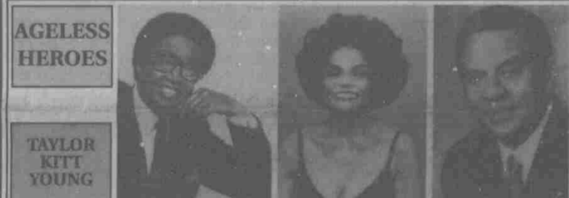
AGELESS HEROES. Award-winning jazz musician and educator Dr. Billy Taylor (left), legendary entertainer Eartha Kitt (center), and Andrew Young (right) former Mayor of Atlanta and civil rights activist, are three of the men and women profiled in "AGELESS HEROES," a one-hour special challenging the myths and misconceptions of life after age 65. It will be broadcast on PBS, Wednesday, April 29, 1998 (9:00-10:00 PM, ET). (Check local listings) The special is a production of Cappy Productions, Inc. and Age Wave Health Services, Inc. The Blue Cross and Blue Shield Association and the independent Blue Cross and Blue Shield companies are the sole underwriters of this film.

EARTHA KITT, DR. BILLY TAYLOR AND ANDREW YOUNG ARE PROFILED IN "AGELESS HEROES," A NEW ONE-HOUR SPECIAL CHALLENGING THE MYTHS AND MISCONCEPTIONS OF LIFE AFTER AGE 65, TO BE BROADCAST APRIL 29