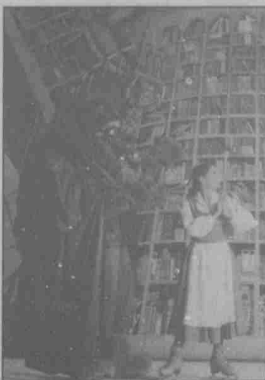
Love conquers all in a tale as old as time. Belle and the Beast skate their way into the heart of audiences in Walt Disney's World on Ice Beauty and the Beast.