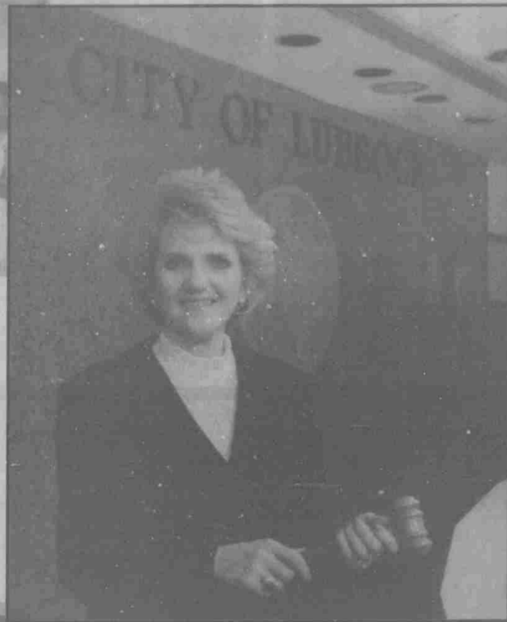
Mayor Wendy Sitton