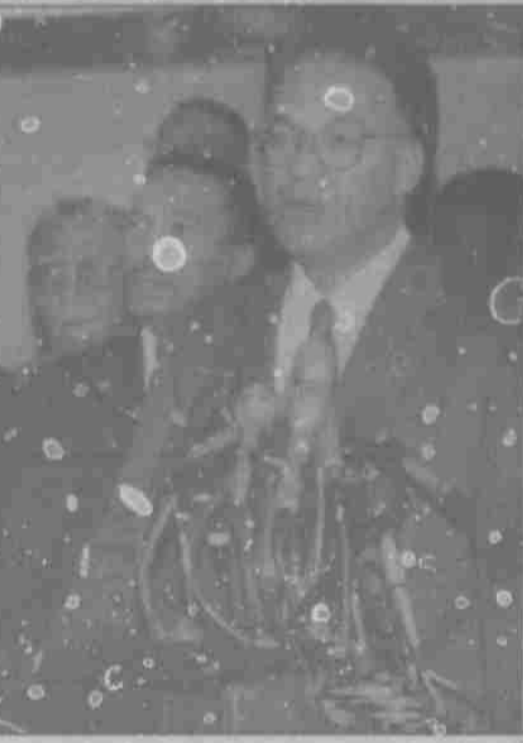
Washington, D.C. — National Urban League President Hugh Price, right, flanked by civil rights leaders Kweisi Mfume, president & ceo, NAACP; Dr. Joseph Lowery, chairman, Black Leadership Forum; Abe Foxman, president, Anti-Defamation League; Joe Madison, Washington, D.C. radio talk show host; and many others, spoke in unison in a call for action against police brutality.

"This issue has galvanized us," said Cochran, noting the breadth of organizations that delivered a collective plea to President Clinton to stem the police brutality that is sweeping the nation. Mr. Cochran is representing Amadou Diallo's family. Mr. Diallo was shot and killed by New York City Police, who fired forty-one shots at the