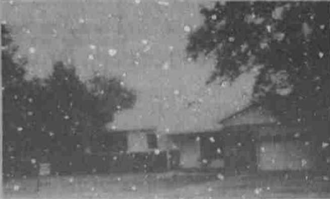
2614 East Auburn Avenue - 3 Bedroom, Bath, Garage "Choice of Carpet"