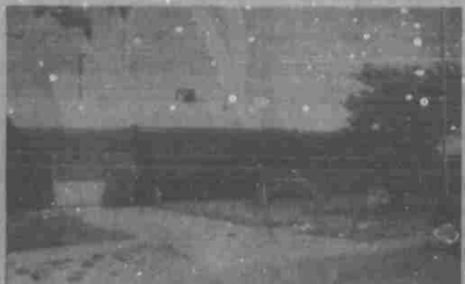
1201 47th Street - 3 Bedroom, Bath "Ready to move in!"