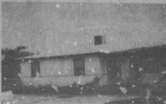
3420 East 18th - 3 Bedroom, Bath, Large Kitchen Area - Nice Home!