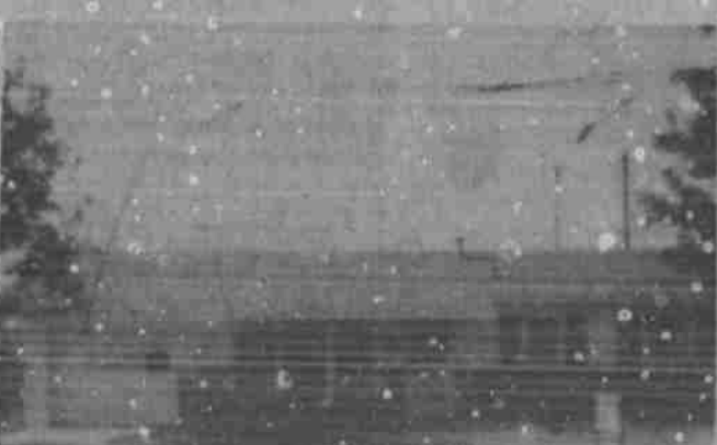
2003 East Bates Avenue - 3 Bedroom, Bath, Garage "Owner will carry note at 12%"