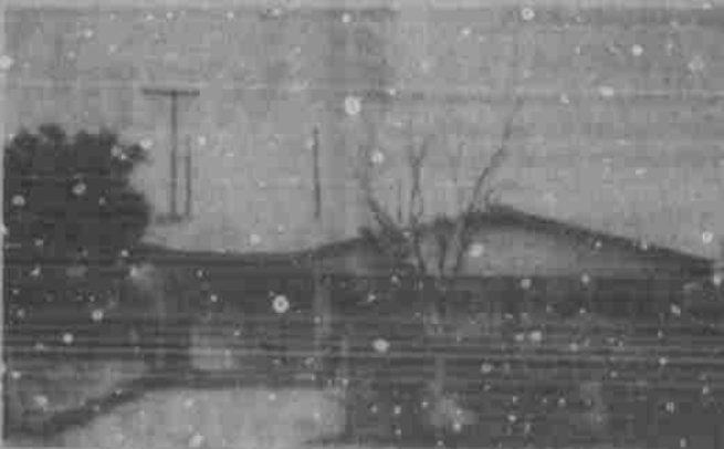
2401 East 9th Street - 3 Bedroom, 2 Bath, Carpet "Nice home - need a buyer!"