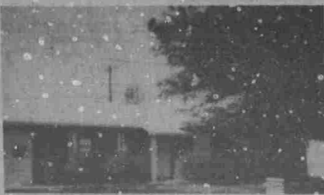
3411 East Cornell Avenue - 3 Bedroom, Bath, Garage "Owner will help with closing."