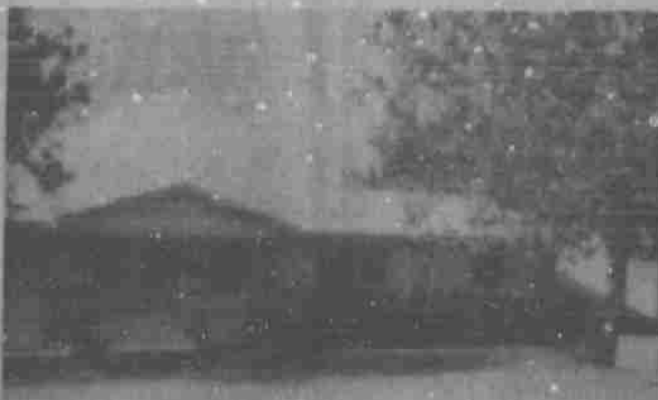
1931 East Colgate Avenue - 3 Bedroom, Bath, Garage "New carpet will be installed!"