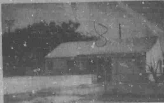
2826 East 7th Street - 2 Bedroom, Bath, Garage "House on large acreage of land. Cute one bedroom house in back. Rent for $150.00 or more!"