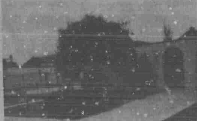
6026 27th Street - 3 Bedroom, 2 Bathroom "Skylight - Sun Room - Fire Place"