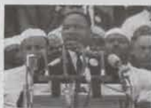
ATLANTA (AP) —

DreamWorks plans the first big-screen portrayal of the Rev. Martin Luther King Jr.'s life, the studio announced Tuesday, but two of King's children immediately threatened legal action because the film deal was brokered without their blessing.