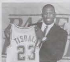
This Oct. 10, 1985 file photo shows Wayman Tisdale, holding up his the Indiana Pacer jersey after he signed his contract with the team in Indianapolis.

"I don't know of any athlete at Oklahoma or any place else