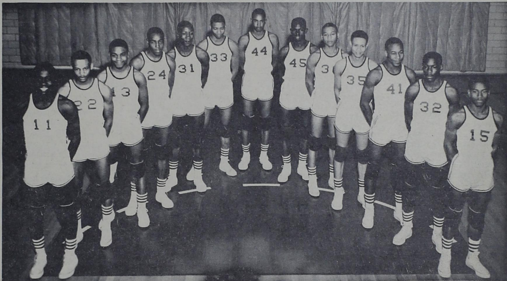
State Champion Dunbar Panthers

Several hundred Lubbock fans gathered at Dunbar High School gym Sunday afternoon in a city wide welcome to the victorious Dunbar Panthers who won the State championship at Prairie View Saturday morning