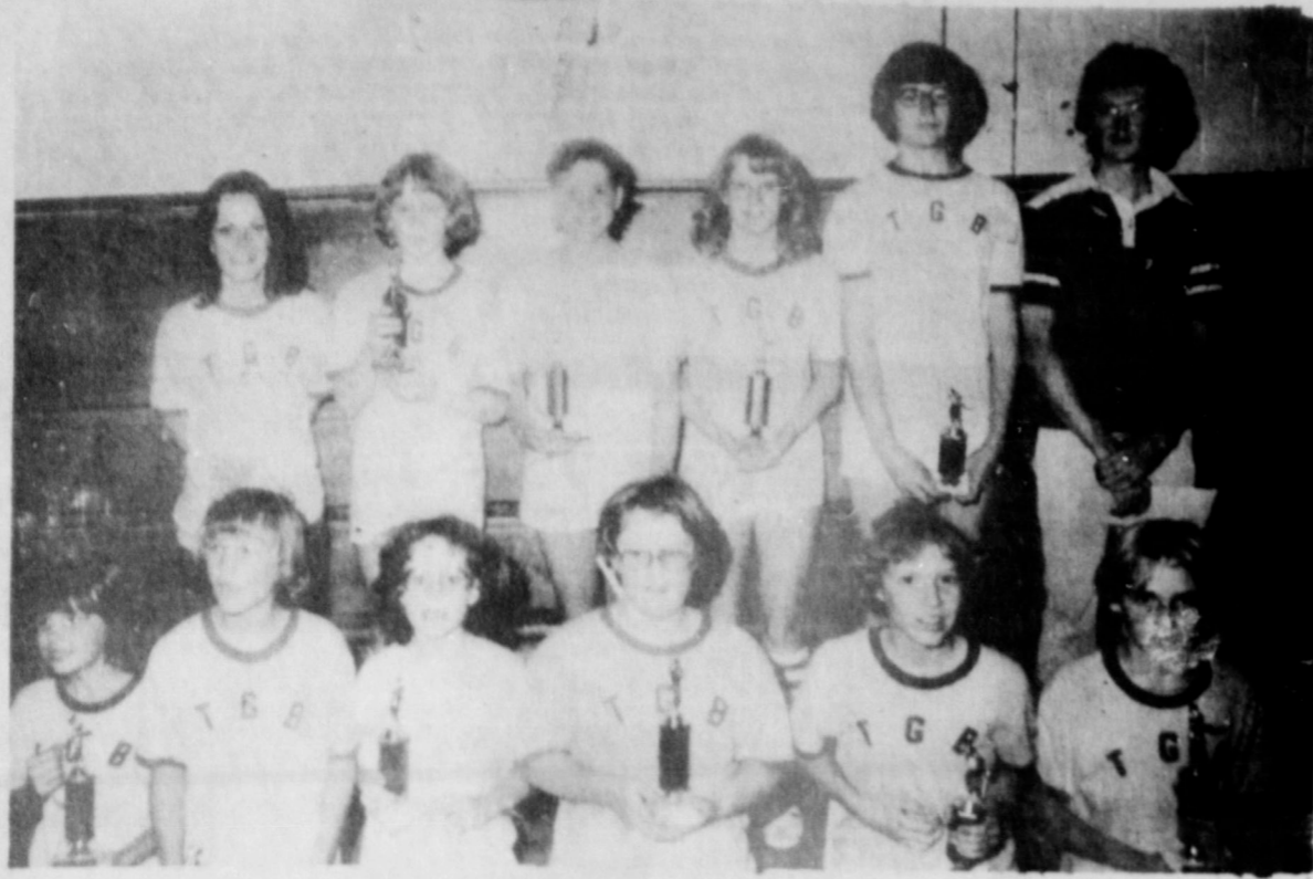
PICTURED ABOVE are the Major League All-Tournament players and coaches.