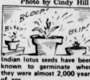
Indian lotus seeds have been known to germinate when they were almost 2,000 years of age.