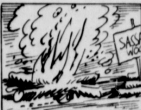
Some say it's bad luck to burn sassafras wood.

"Total abstinence is easier than perfect moderation." St. Augustine