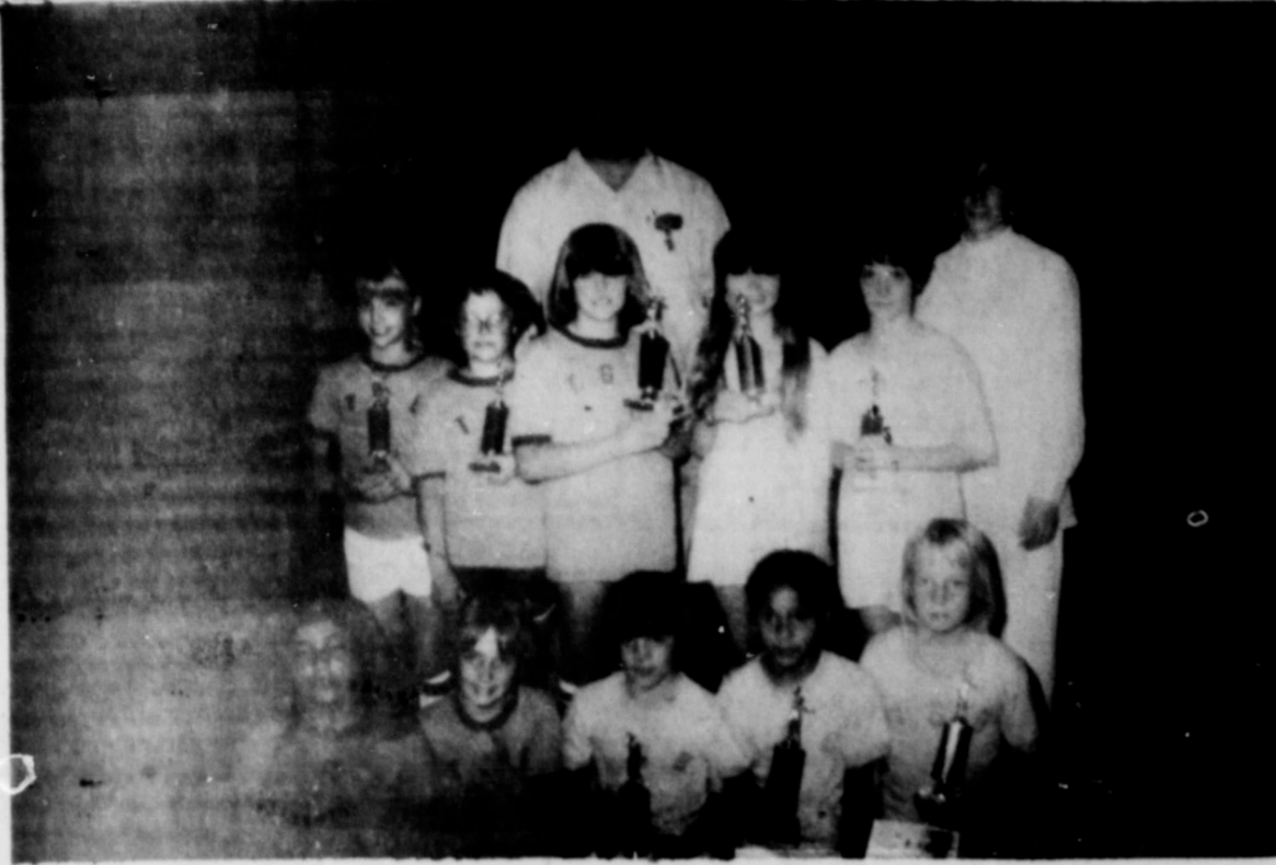
PICTURED ABOVE are the Minor League All-Tournament players and coaches.