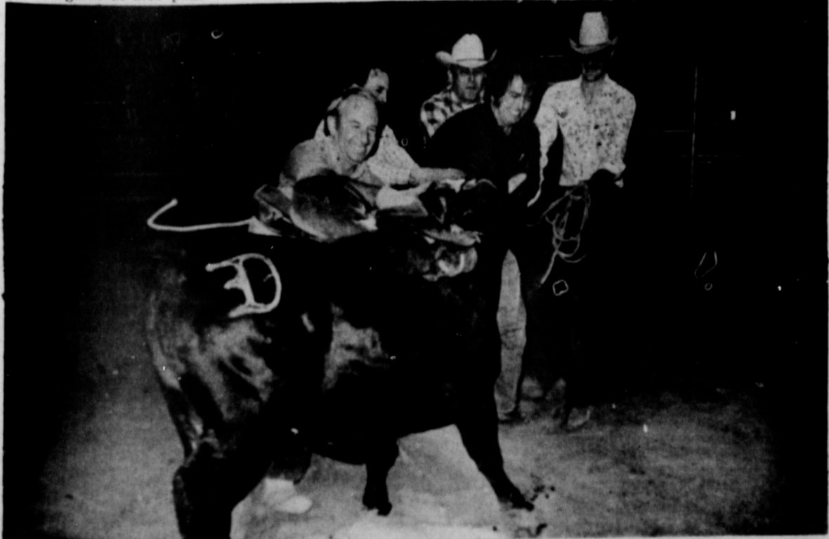
HANG TIGHT was the name of the game Friday night at the High School Rodeo.