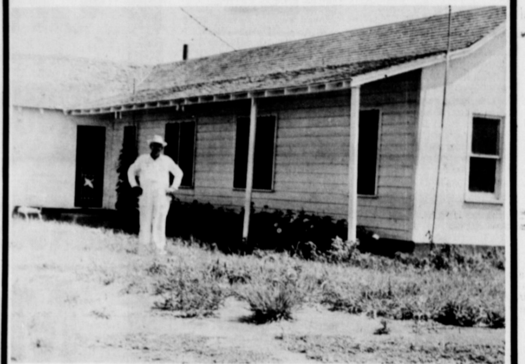
A SCENE FROM THE J. B. JAMES FARM