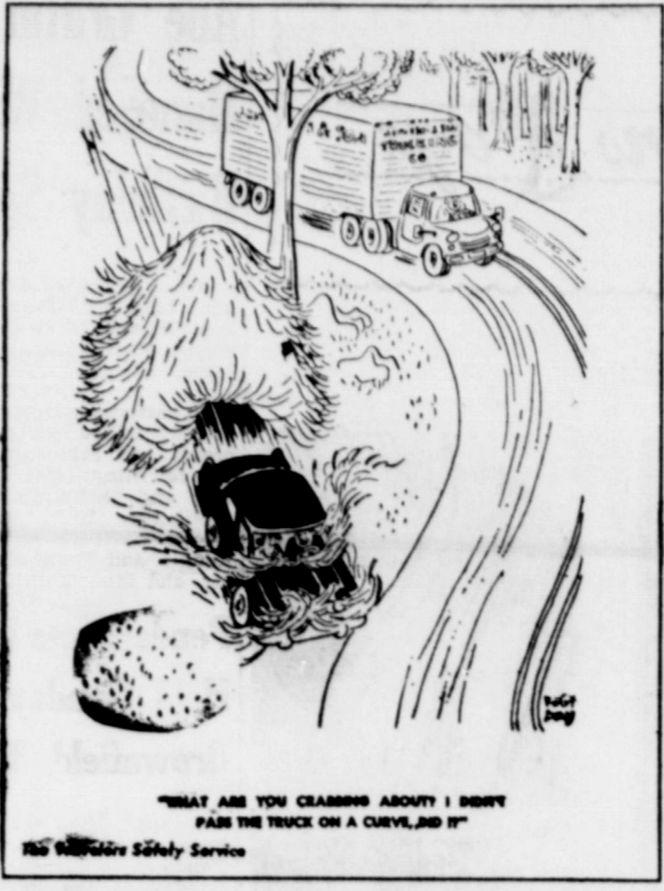
Reckless driving and driving off the roadway caused almost 600,000 casualties in 1960.