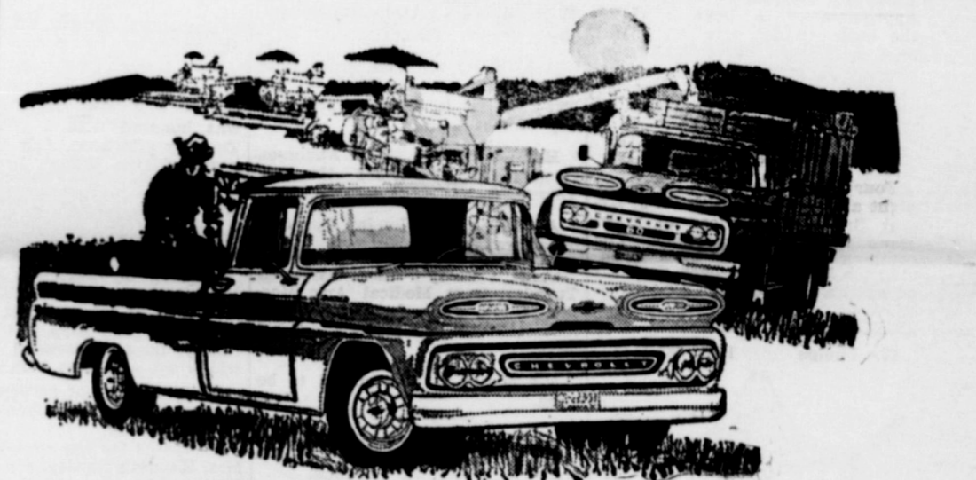
Fleetside Pickup and Horton 60 with high rack