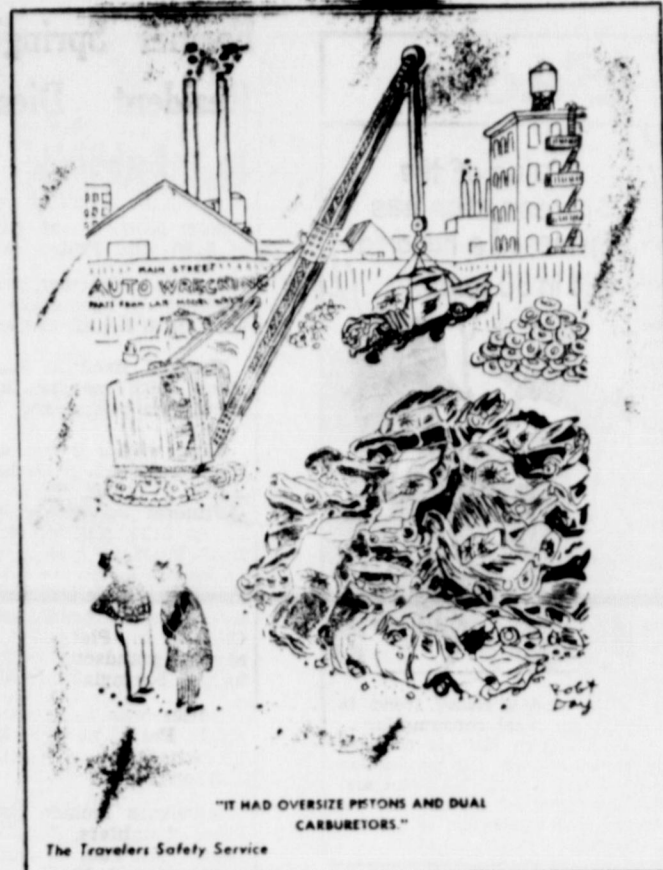
85% of the vehicles involved in accidents in 1960 were passenger cars.

Arizona, Las Vegas, Nevada, Alhambra, Bakersfield, San Francisco, Heraldsburg, California, Boise, Idaho Falls, Idaho, and Denver, Colo. Included among the outstanding scenic drives would be Salt River Canyon between Globe and Phoenix, Oak Creek Canyon near Flagstaff, Ariz., and the Redwood Highway drive on Highway 101 north of San Francisco.