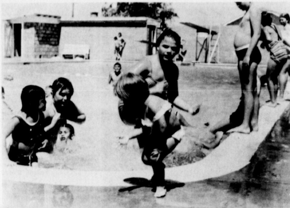
SUMMER TIME IS FUN TIME for youngster in the area who find the City Pool in Earth a relaxing spot during long hot summer days. Some find the pool a bit chilly, but then whose chicken when it comes to swimming??

"We are attempting to make the reporting system more effective so that cotton producers can know with the least possible delay just what the insect situation is and where infestations are spreading," Rothe said.