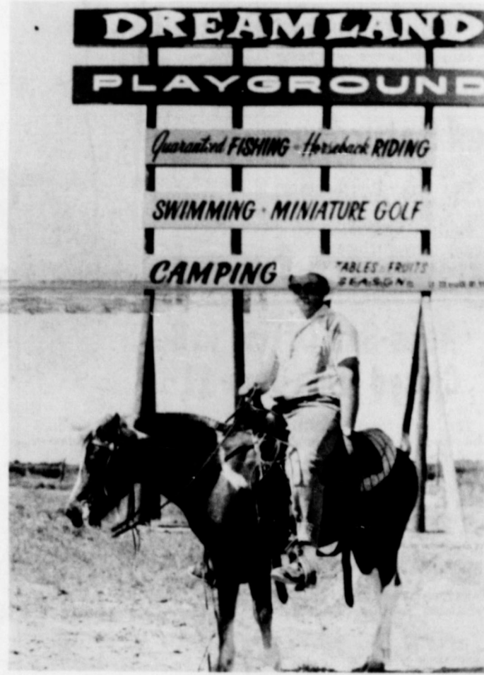
ENJOY YOURSELF AT DREAMLAND PLAYGROUND OF LAMB COUNTY