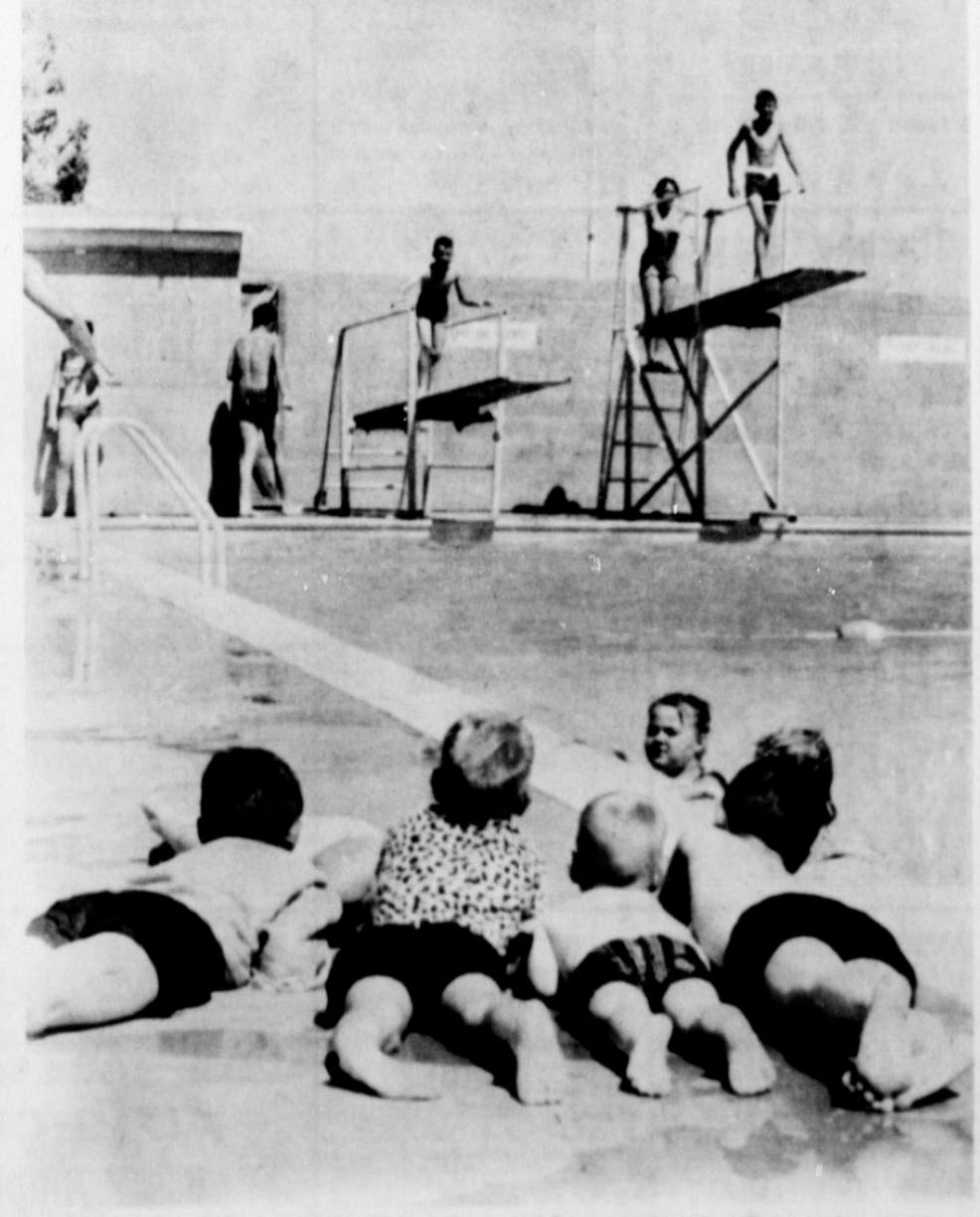
LAZILY STRETCHING IN THE SUN are four youthful sun bathers huddled together as they observe swimmers with chattering teeth plunge into the water. Well, it's fun just to watch others swim occasionally.