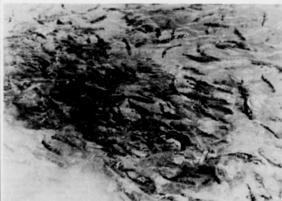
RAINBOW TROUT, WAITING TO BE CAUGHT

Organic VEGETABLES & FRUITS IN SEASON MINATURE GOLF