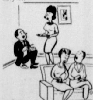
"Oh my yes, I'm a nut for buffets—love to eat off the floor, really—"

Please read the census blank carefully, fill it out completely and return it to school by your child, or bring it to the school superintendent's office no later than Tuesday, January 31.