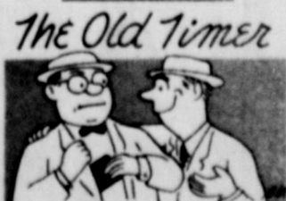
"A borrower is a man who tries to live within your means."