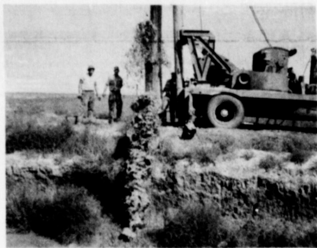
DEVELOPING A NEW HOLE WITH A 30 FOOT, 14 INCH BALER